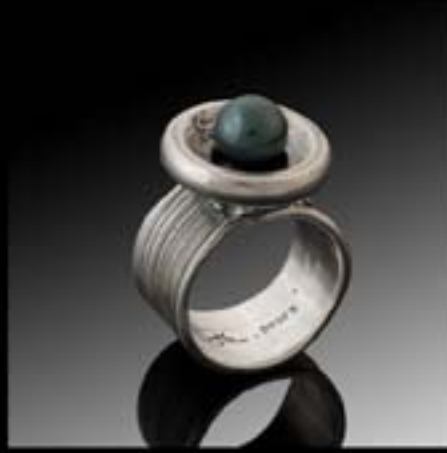
ring no.2 item #R002