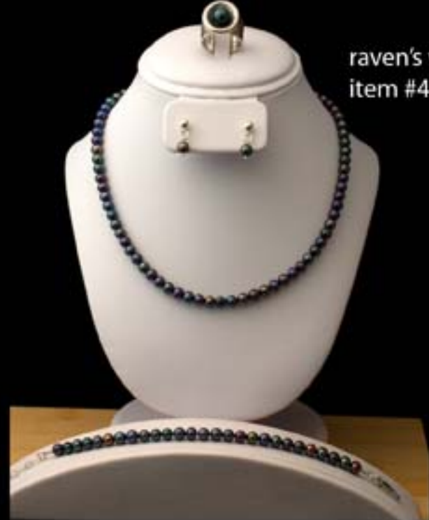
raven's wing earrings item #4014