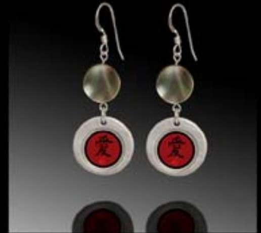
earrings item #4021