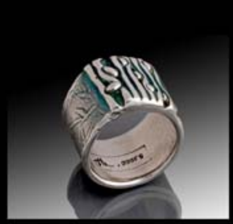
ring no.3 item #R003