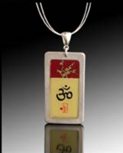
"om" pendant item #2008