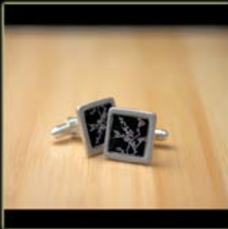
silver & resin cufflinks (cherry blossom) item #mens8003