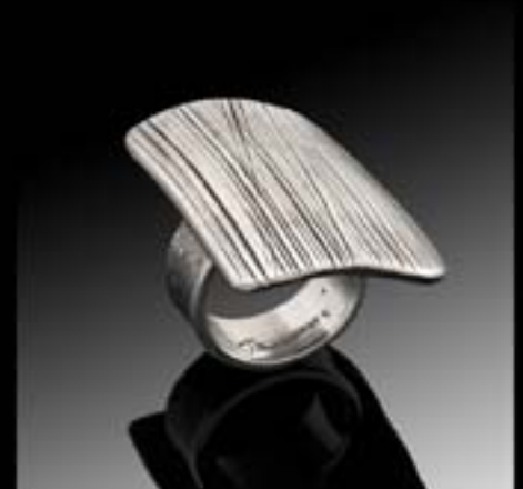
ring no.8 item #R008