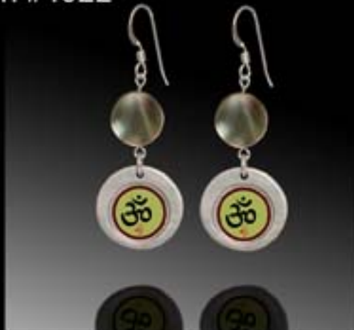
earrings item #4022