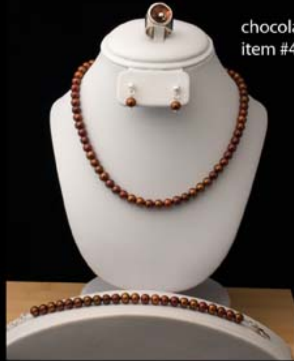
chocolate earrings item #4015