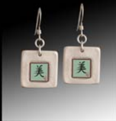
"beauty" earrings item #4016