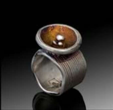
ring no.6 item #R006