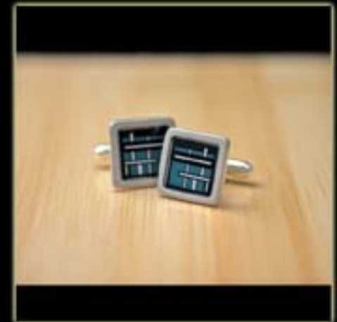
silver & resin cufflinks (cherry blossom) item #mens8003