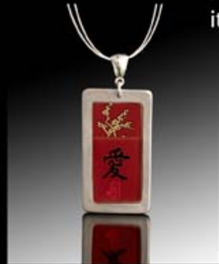
"love" pendant item #2007