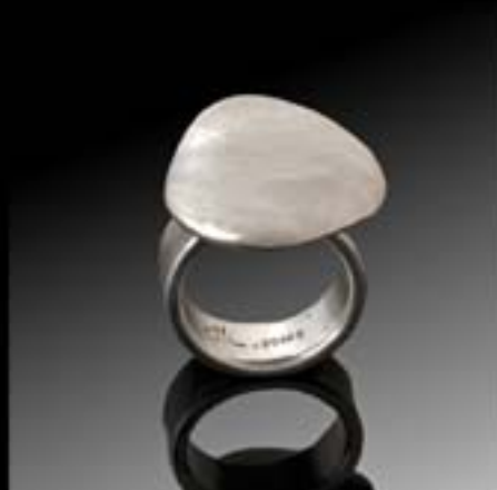
ring no.7 item #R007