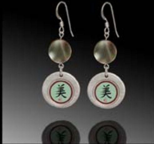
earrings item #4020