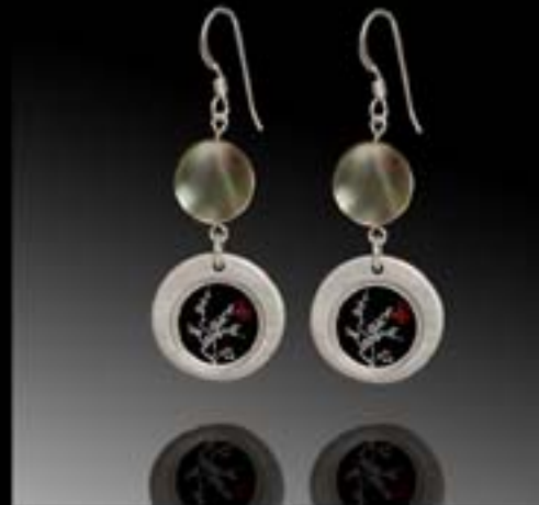
earrings item #4024