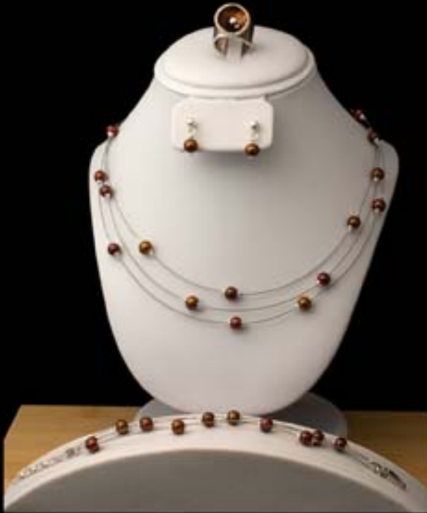
chocolate floating pearl necklace three-strand item #5003