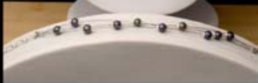
raven's wing floating pearl bracelet three-strand item #6004