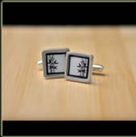
silver & resin cufflinks (bamboo) item #mens8001