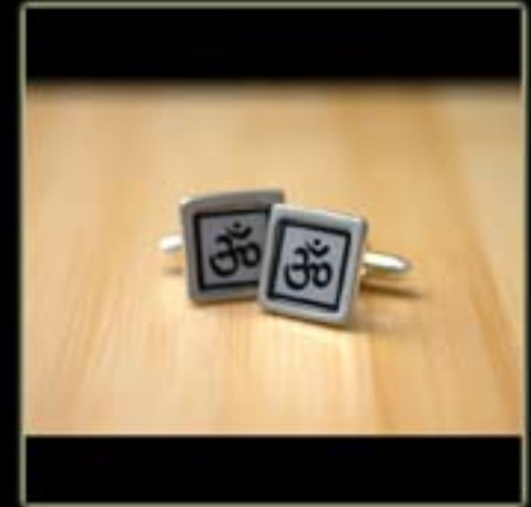
silver & resin cufflinks (om) item #mens8002