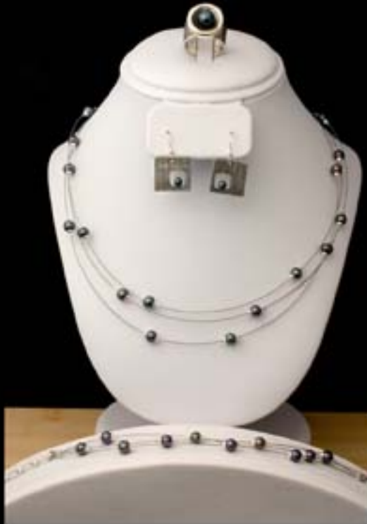
raven's wing floating pearl necklace three-strand item #5001