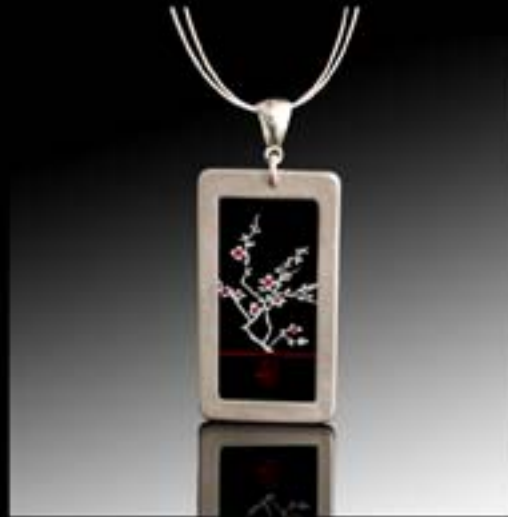
"cherry blossom" pendant item #2010