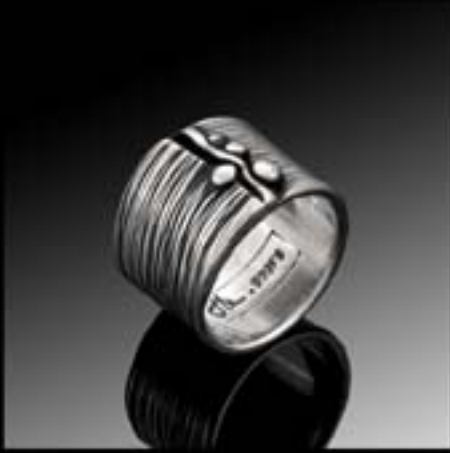
ring no.1 item #R001