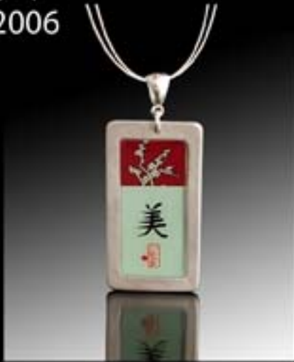
"beauty" pendant item #2006